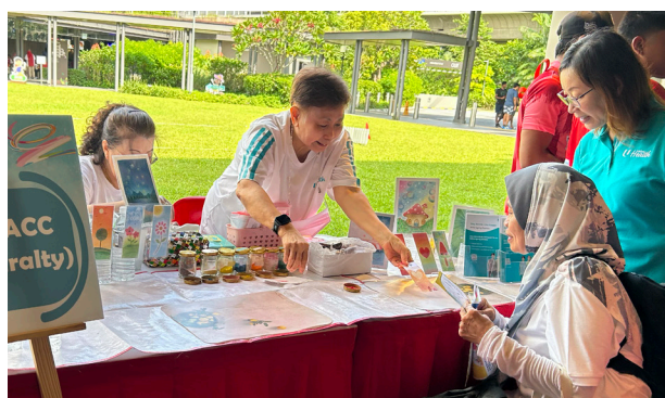
Page 7 Sembawang Shapes Up at Health Fiesta