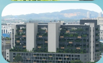
5 mins from Woodlands Mart 8 bus stops from Causeway Point 五分钟从兀兰市场或八个巴士站从长堤坊

Exclusive to all Sembawang Residents! 专属于所有三巴旺居民!