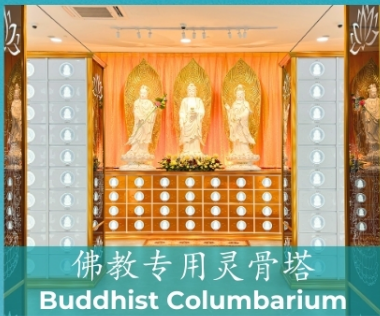
佛教专用灵骨塔 Buddhist Columbarium