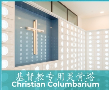
基督教专用灵骨塔 Christian Columbarium

Lock in prices in advance to safeguard yourself and loved ones from unexpected costs 提前做好安排并锁定价格，可以保护您和亲人免受意外费用的影响