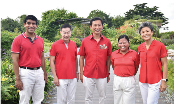
Page 3 New Openings at Bukit Canberra