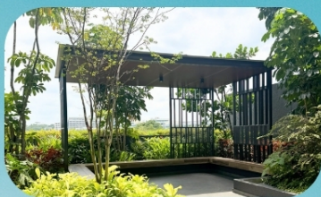
Green Garden Building 绿色花园建筑

兀兰永念堂 WOODLANDS MEMORIAL A BETTER PLACE 爱永恒 念不忘