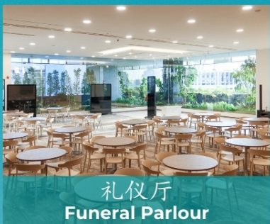
礼仪厅 Funeral Parlour

单穴福位从 Single Niche from $1,888 起 双穴福位从 Double Niche from $2,888 起