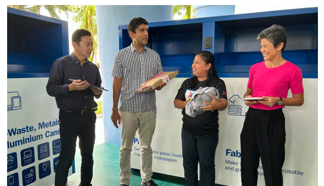
Page 13 Boosting Sustainability with ALBA I-Bins Launch