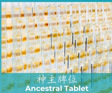
神主牌位 Ancestral Tablet