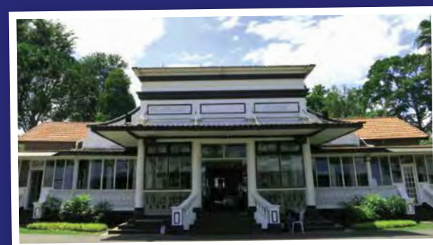
Sembawang Park — Beaulieu House