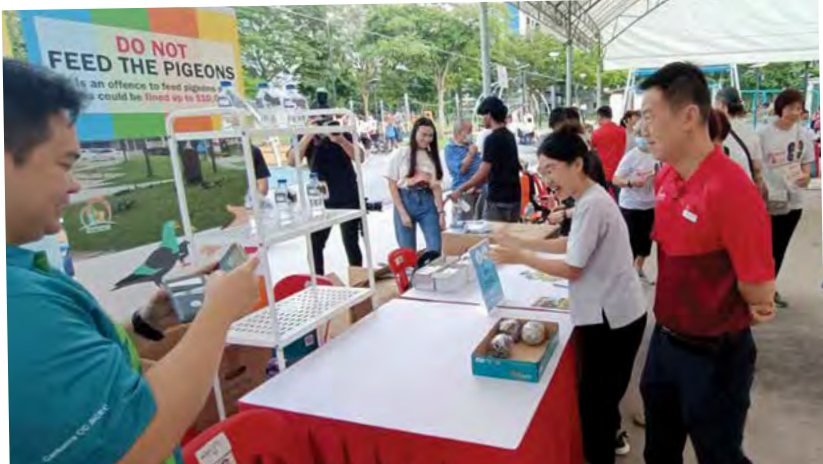
Dr Lim Wee Kiak, Adviser to Canberra, observed a booth where important information on maintaining proper human-pigeon interactions was presented through games.

The Canberra Active Ageing Committee organised its yearly active ageing carnival on 16 December 2023 to encourage our seniors to lead healthier lifestyles, under the theme “Get Active, Stay Active!” Seniors and their family members engaged in group exercises such as a brisk walk around Canberra and chair exercises. They were joined by Dr Lim Wee Kiak, Adviser to Canberra, who shared three tips to keep fit, such as eating healthy, having enough rest, and staying active. Famous filmmaker Mr Jack Neo hyped up the crowd with a sing-along session. A beautiful morning was spent where seniors, advisers, and participants made memories and took home health tips.