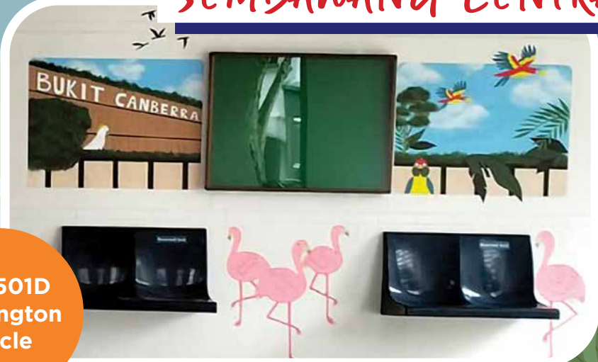
Blk 501D Wellington Circle