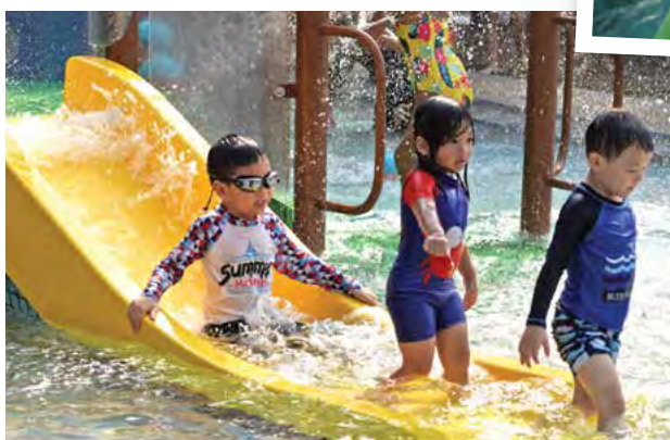
Besides the eight-lane competition pool and six-lane sheltered pool for adults, there is a wading pool and a fun pool for children to enjoy water activities too!

Spanning 1,500 square metres, the gym offers a variety of workout options to cater to individual fitness goals, such as functional fitness exercises, resistance training, free weight training and cardiovascular exercises. It is thoughtfully designed with HUR machines (which use air pressure in place of traditional weights) to encourage seniors to keep fit. Popular classes such as Zumba, Piloxing and Hatha Yoga are also offered at the dance studio next door.