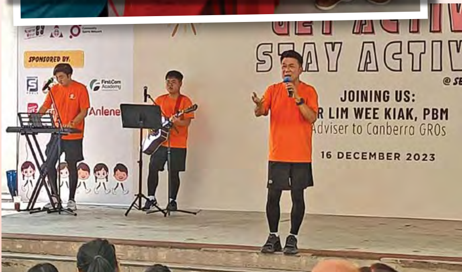
Famous filmmaker Mr Jack Neo invited residents to sing a few songs together.

The Canberra Active Ageing Committee organised its yearly active ageing carnival on 16 December 2023 to encourage our seniors to lead healthier lifestyles, under the theme “Get Active, Stay Active!” Seniors and their family members engaged in group exercises such as a brisk walk around Canberra and chair exercises. They were joined by Dr Lim Wee Kiak, Adviser to Canberra, who shared three tips to keep fit, such as eating healthy, having enough rest, and staying active. Famous filmmaker Mr Jack Neo hyped up the crowd with a sing-along session. A beautiful morning was spent where seniors, advisers, and participants made memories and took home health tips.