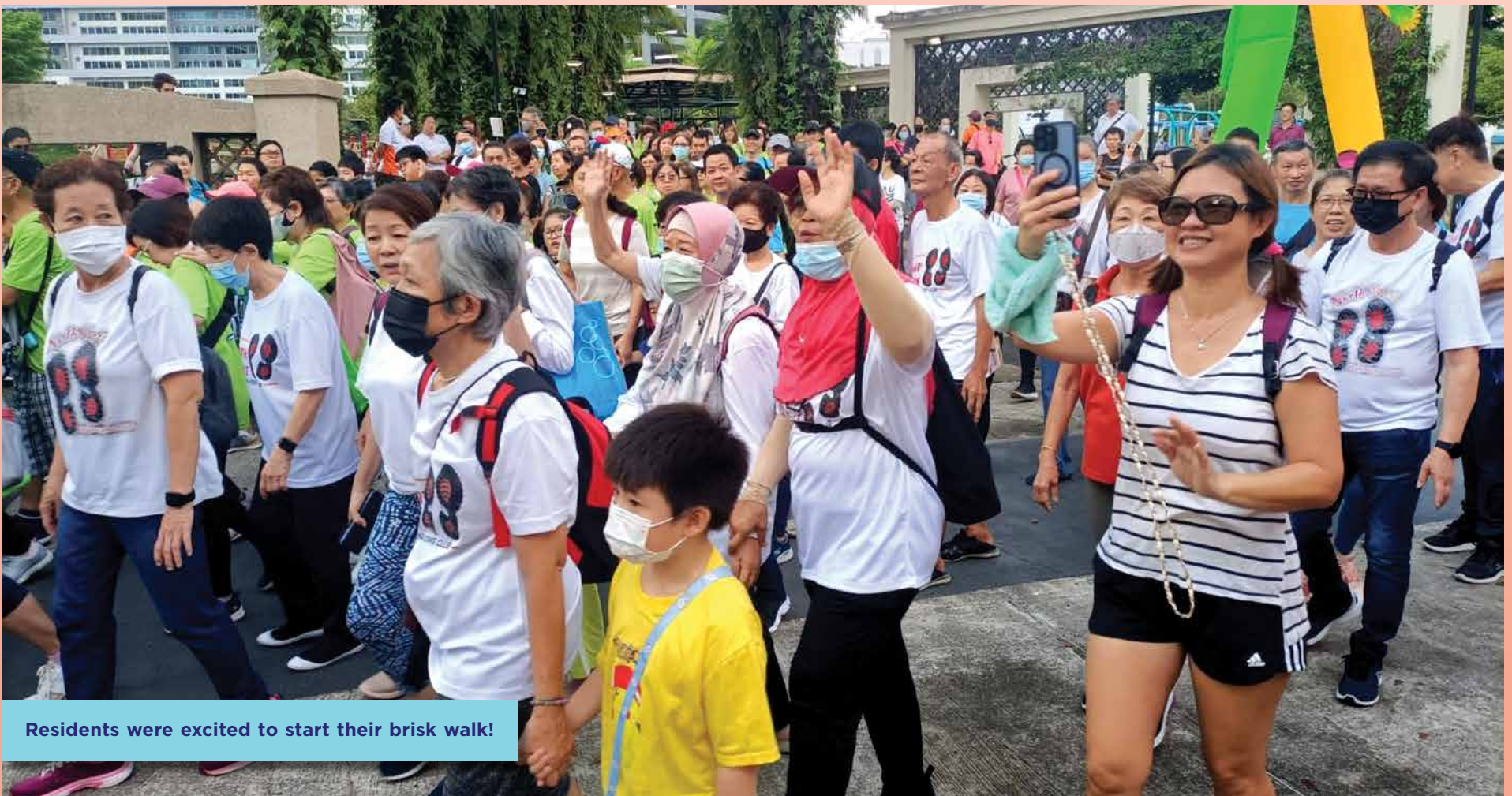
Residents were excited to start their brisk walk!