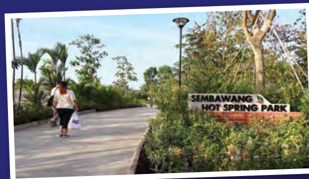
Sembawang Hot Spring Park