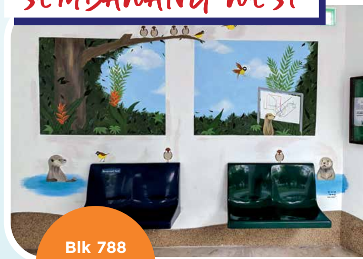
Blk 788 Woodlands Ave 6