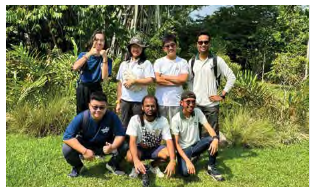
Page 13 #PeopleofSembawang: Sembawang Nature e-Guidebook