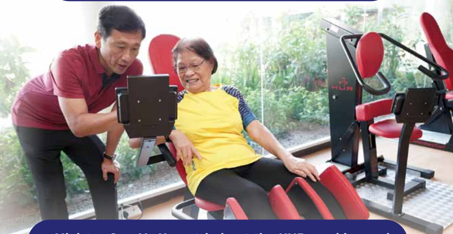
Minister Ong Ye Kung tried out the HUR machine and participated in a workout session with residents.

Spanning 1,500 square metres, the gym offers a variety of workout options to cater to individual fitness goals, such as functional fitness exercises, resistance training, free weight training and cardiovascular exercises. It is thoughtfully designed with HUR machines (which use air pressure in place of traditional weights) to encourage seniors to keep fit. Popular classes such as Zumba, Piloxing and Hatha Yoga are also offered at the dance studio next door.