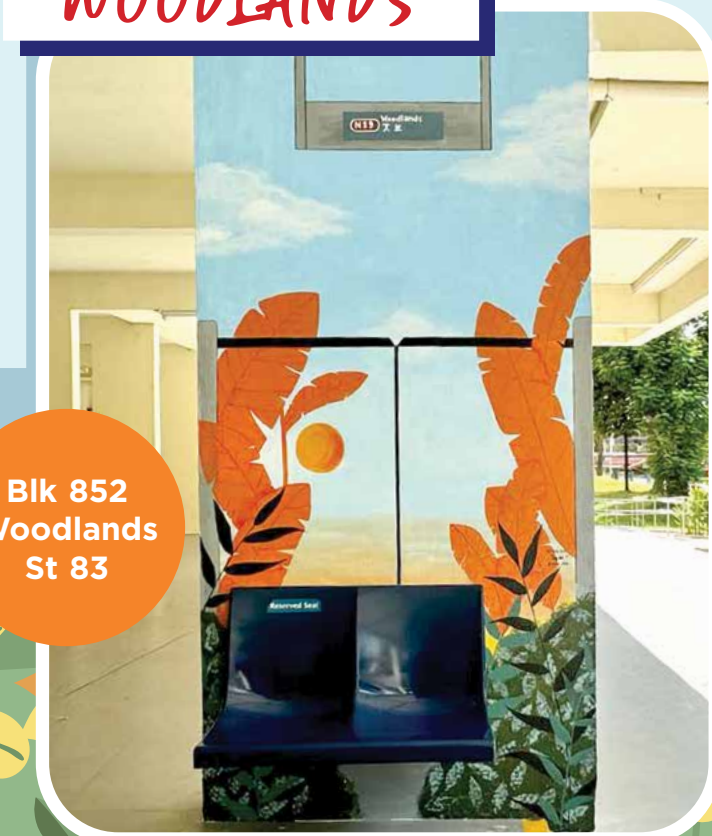
Blk 852 Woodlands St 83