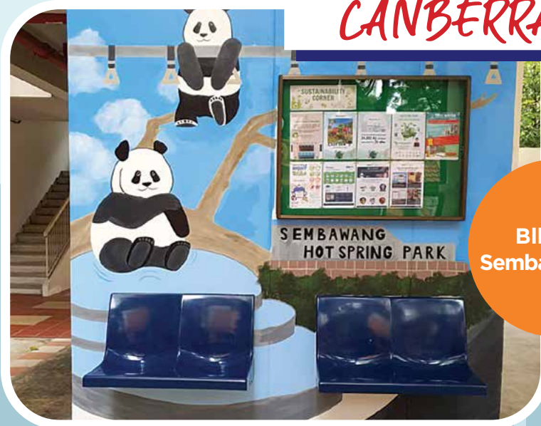
Blk 476 Sembawang Dr