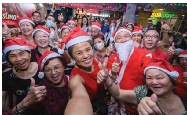
Page 9 Christmas in Sembawang