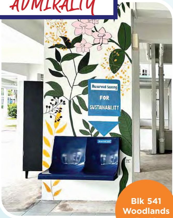
Blk 541 Woodlands Dr 16