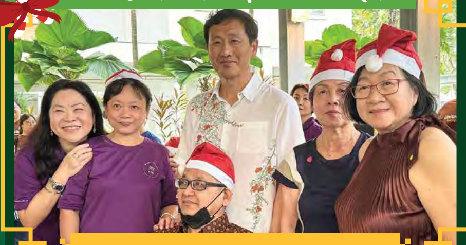
Mr Ong Ye Kung, Minister for Health and Adviser to Sembawang Central, shared the festive joy and happiness with elderly residents.