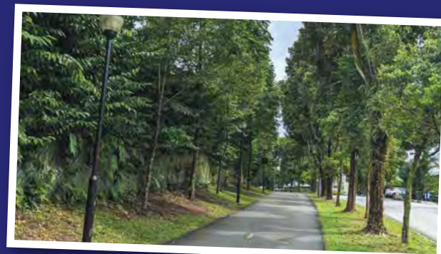
Canberra-Sembawang Park Connector