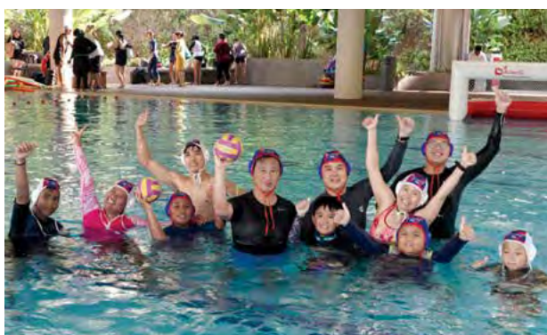
Page 3 Bukit Canberra Integrated Sports and Community Hub

Check out our tree planting events on page 4-5