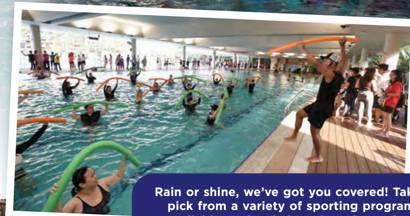
Rain or shine, we've got you covered! Take your pick from a variety of sporting programmes available at the sheltered pool area for your daily workout fix.