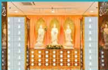
佛教专用灵骨塔 Buddhist Columbarium