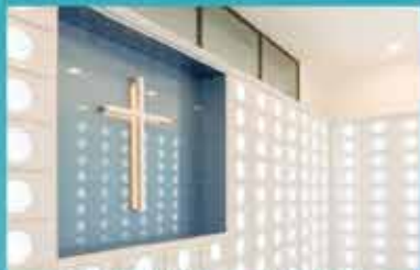
基督教专用灵骨塔 Christian Columbarium

Lock in prices in advance to safeguard yourself and loved ones from unexpected costs 提前做好安排并锁定价格，可以保护您和亲人免受意外费用的影响