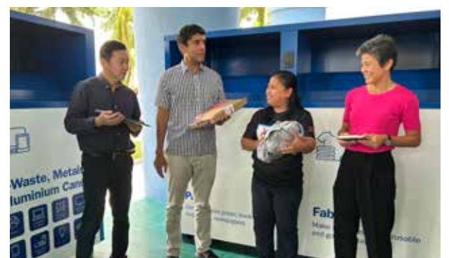
Page 13 Boosting Sustainability with ALBA I-Bins Launch