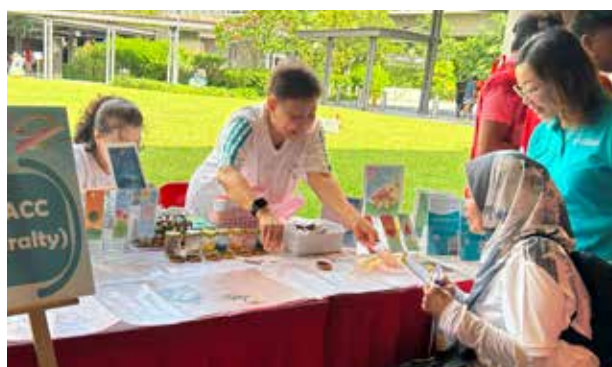
Page 7 Sembawang Shapes Up at Health Fiesta