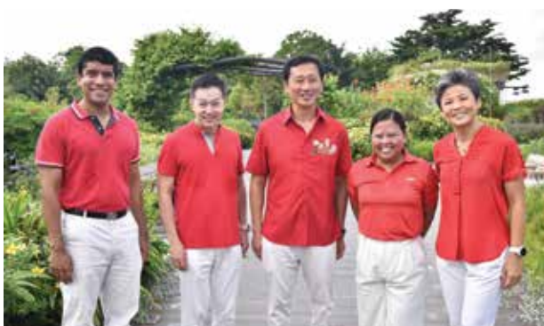
Page 3 New Openings at Bukit Canberra