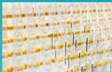
神主牌位 Ancestral Tablet