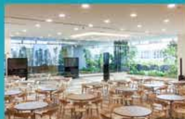
礼仪厅 Funeral Parlour

单穴福位从 Single Niche from $1,888 起 双穴福位从 Double Niche from $2,888 起