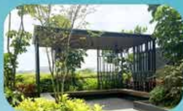
Green Garden Building 绿色花园建筑

兀兰永念堂 WOODLANDS MEMORIAL A BETTER PLACE 爱永恒 念不忘