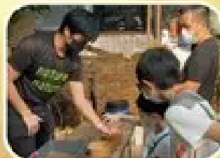
Snack on our Black Soldier Fly (if you dare!)