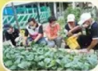
Fresh vegetables harvested from our Community Gardens

Pesticide-free vegetables grown in Sembawang GRC, fresh fruits, handcrafts, fresh bakes, honey, gardening tips and many more! Come support our local Social Enterprises!