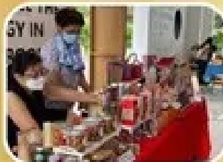
Fresh produce by Social Enterprises