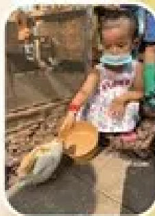
Feed our cute quails