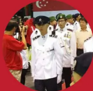
NATIONAL DAY OBSERVANCE CEREMONY