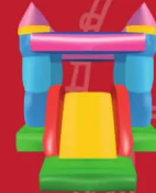
GAME BOOTHS FOR ALL AGES