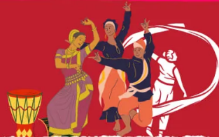
EXCITING & THRILLING PERFORMANCES