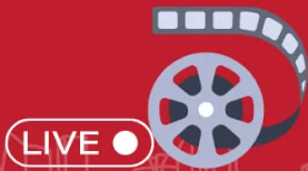
MOVIE (MISSION IMPOSSIBLE : FALLOUT) & NDP LIVE SCREENING