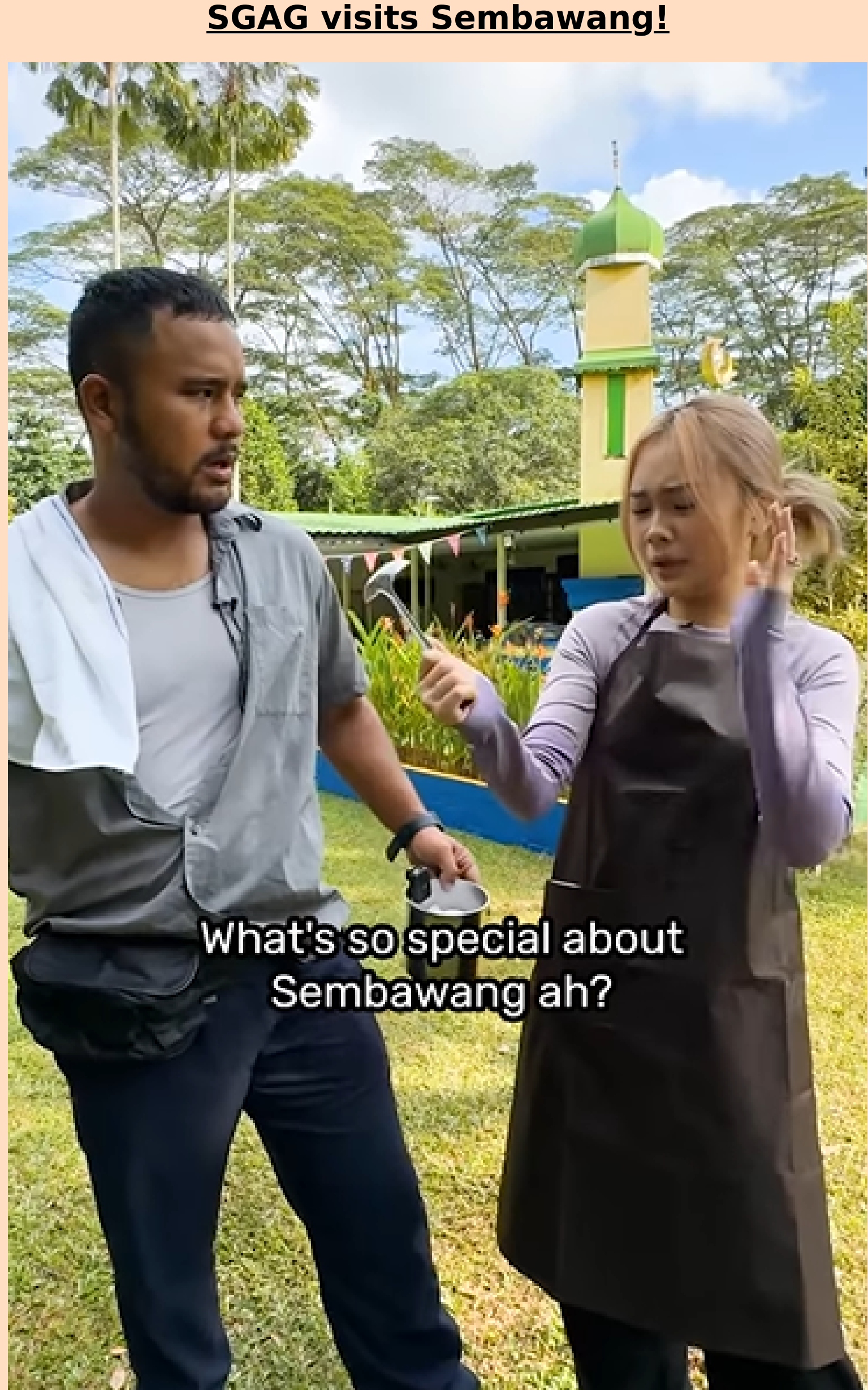
Petempatan Melayu Sembawang, and more. Click 'Find out more' below to watch the video!