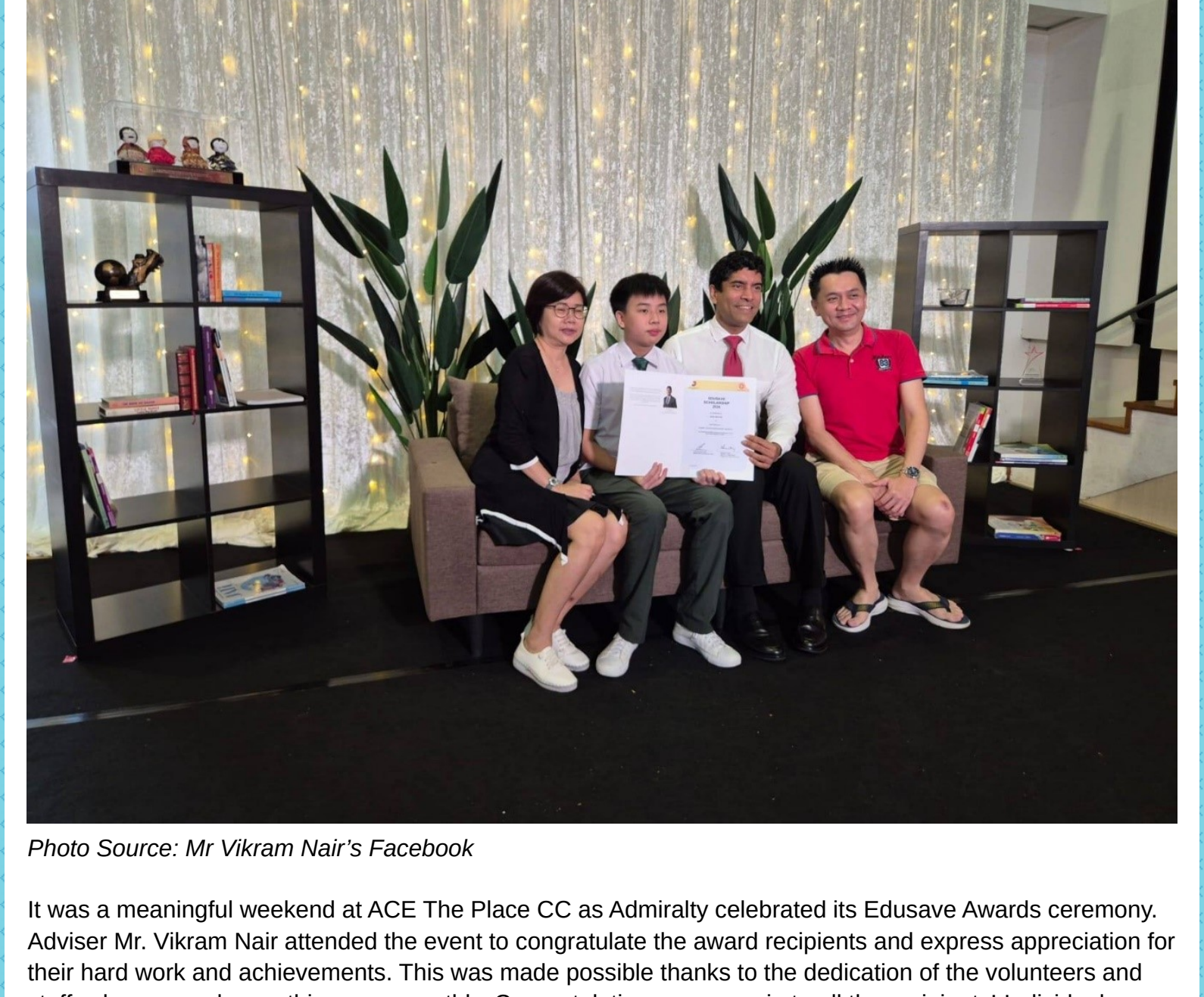
staff, who ensured everything ran smoothly. Congratulations once again to all the recipients! Individual photos are available on the "Our Admiralty" Facebook page.