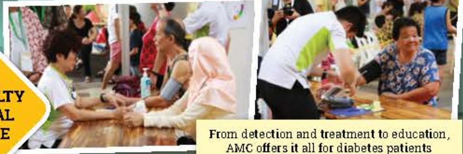
From detection and treatment to education, AMC offers it all for diabetes patients