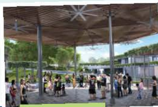
The spacious, cool, sheltered community plaza is large enough to host crowds during community events and celebrations.

The development and landscaping of Bukit Canberra is shaped around the existing terrain, and retains and highlights the hilly characteristics and lush vegetation.