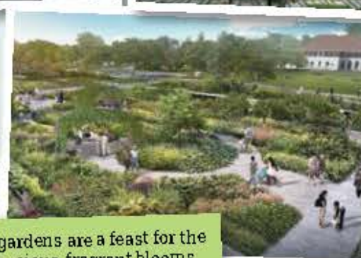
The therapeutic gardens are a feast for the senses, with vivacious, fragrant blooms on full display. It is also wheelchair-accessible, and has shaded rest areas.