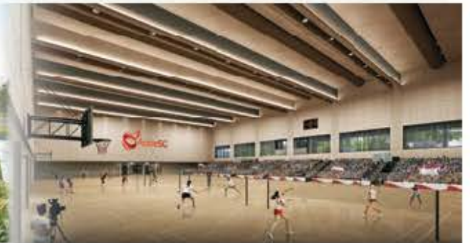
Cheer for your school or local sporting groups at the 500-seater indoor sports hall, which contains badminton, volleyball and basketball courts.