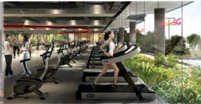
Singapore's biggest ActiveSG gym caters to people of varying physical abilities. Its lush green surroundings make your resistance, cardio, or weights workouts more scenic.