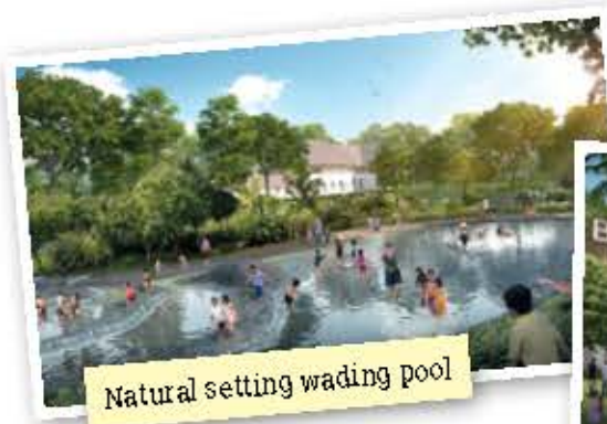
Natural setting wading pool