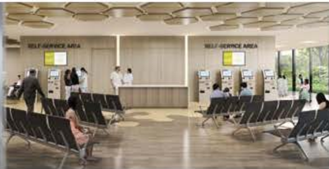
Treatment and consultation on acute and chronic diseases, women's health, and child health are available at the polyclinic.