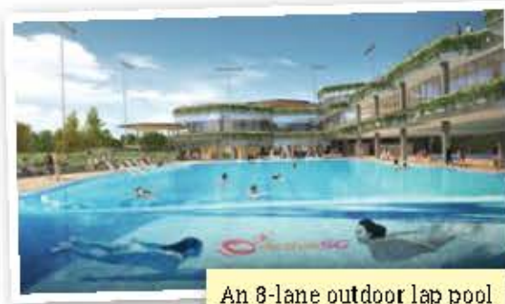
An 8-lane outdoor lap pool