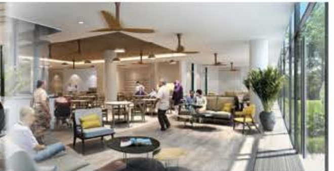
Recreational, rehabilitation, and home-based care services at the senior care centre provide seniors with community support needed to age-in-place.