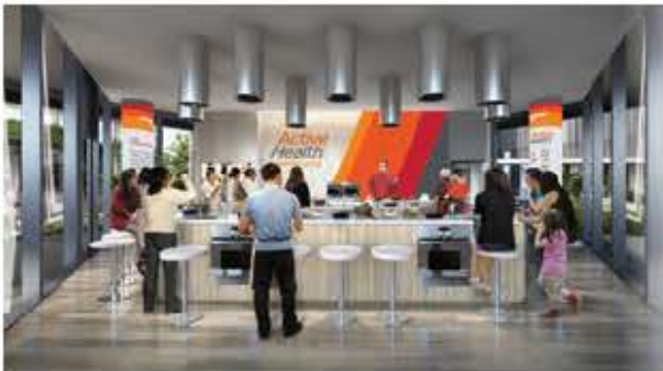
Gain dietary insights and knowledge at the health nutrition studio.