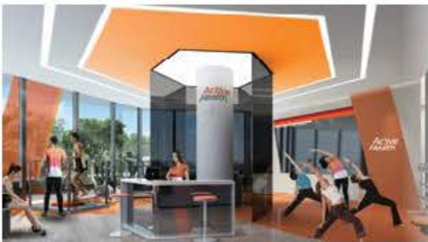
Pick up preventive healthcare techniques through the Active Health Lab's workshops on physical activity, nutrition, sleep and screen time.

ActiveSG Sembawang Sport Centre in Bukit Canberra will have Town Sport Centre features under the Sports Facilities Master Plan (SFMP).