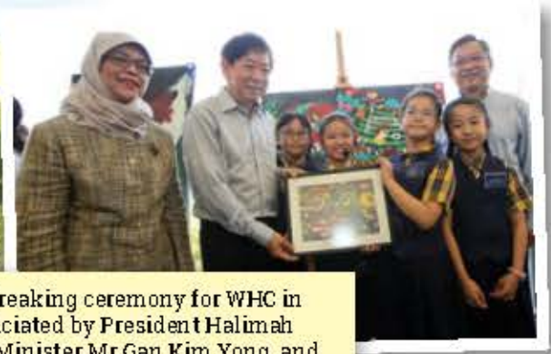
The ground breaking ceremony for WHC in 2017 was officiated by President Halimah Yacob, Health Minister Mr Gan Kim Yong, and Sembawang MPs