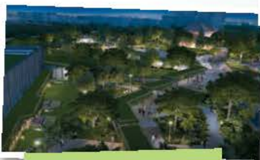
Spot beautiful butterflies along the flower-lined paths of the butterfly garden.