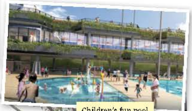
Children's fun pool