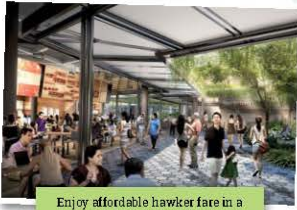
Enjoy affordable hawker fare in a park-like environment.