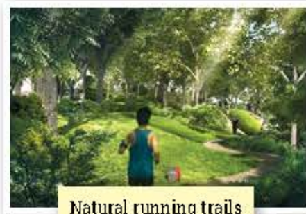
Natural running trails