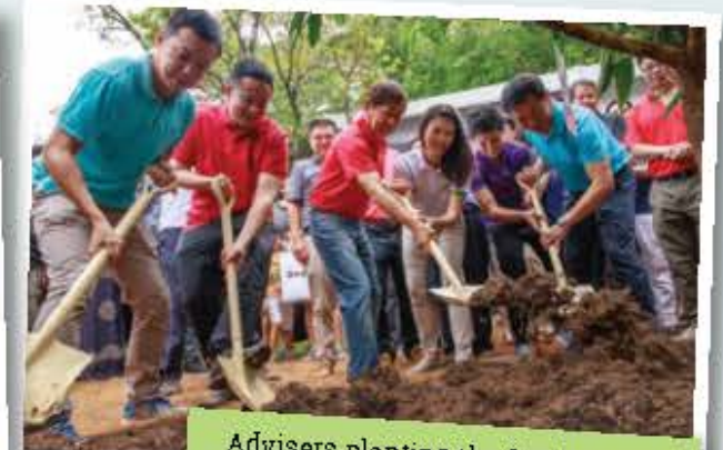
Advisers planting the Sembawang tree to mark the start of construction work for Bukit Canberra.