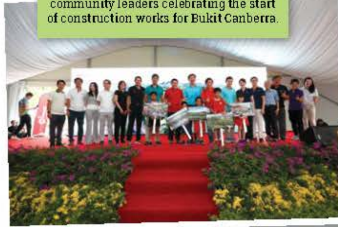
Sembawang Grassroots Advisers and community leaders celebrating the start of construction works for Bukit Canberra.