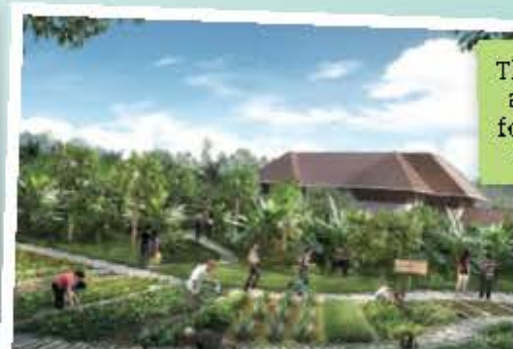
The semi-dense Fruit Orchard and Food Forest are suitable for community gardening and related, small-scale events.