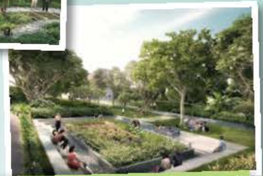
The sunken garden: a quiet, idyllic spot for reading or to catch a breather as you roam Bukit Canberra's ample green grounds.