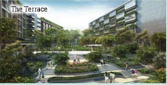
Specialist outpatient clinics in WHC